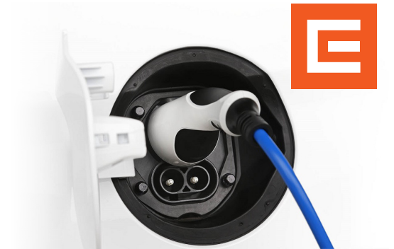
The charging system is compatible with ČEZ Wallbox chargers

The vehicles stand out for their quiet, emission-free operation, low cost, wide variety of uses, ergonomic comfort, and premium functions, such as remote vehicle diagnosis.